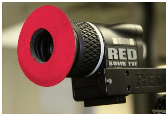
Step1: Naked eyecup

Made to fit the RED BOMB EVF & other eyecups of this size (plus a variety of still cameras!)